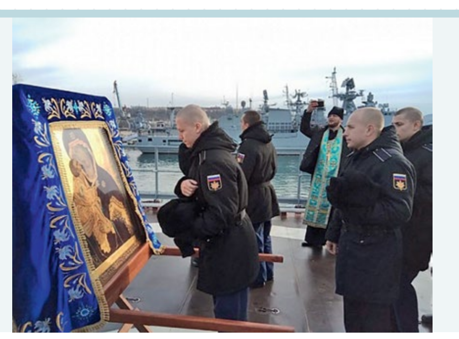
Photo 12. The icon of Mother of God of Don on MOSKVA missile cruise, January 3<sup>rd</sup> 2018.

For November 1<sup>st</sup>—3<sup>rd</sup> 2017 a church procession of several hundreds of people walked from the Toplovka Nunnery to Feodosiya (about 40 km). The representatives of paramilitary groups also participated in the procession. The authorities de facto did not oppose the procession as they do for other religious groups. On the contrary, they assigned the police to escort it.