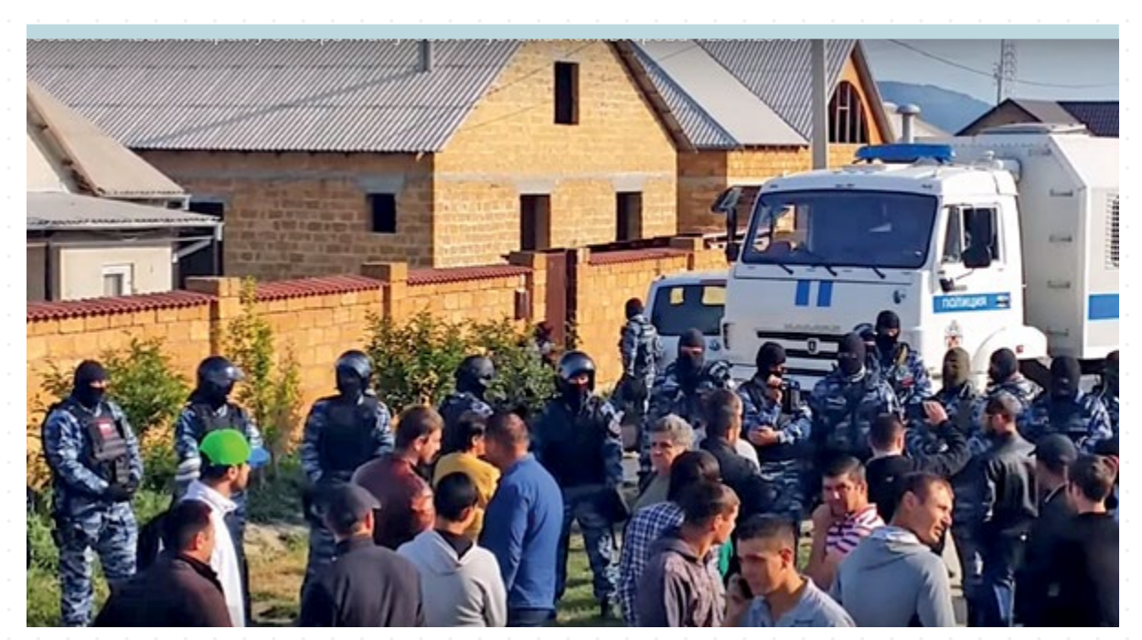
Photo 4. Detention of Muslims in Bakhchisarai, May 12th 2016. Screenshot

The detained in October 2016 and October 2017 are in the Simferopol Detention Facility No 1. It should be noted that as they were detained after adoption of the 'Yarovaya's Package', the accused of 'Hizb-ut-Tahrir' membership face even 10 to 12 years' imprisonment, and those accused of organizing — a life sentence.