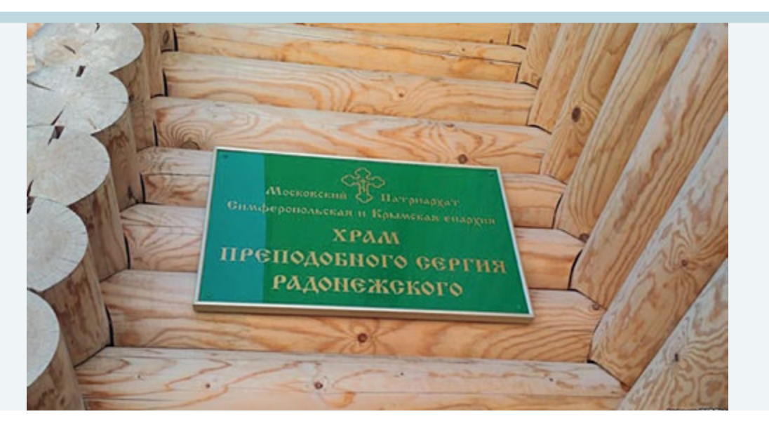
Photo 8. The sign plate on the Church of St. Sergius of Radonezh, September 2017.

In September 2017 it was informed that the churches of MP UOC got the sign plates saying 'Moscow Patriarchate. Simferopol and Crimean Eparchy'. As Clement, Archbishop of MP UOC, informed, the Crimean Eparchy was still a part of UOC, and signs on the churches were not official documents<sup>121</sup>.