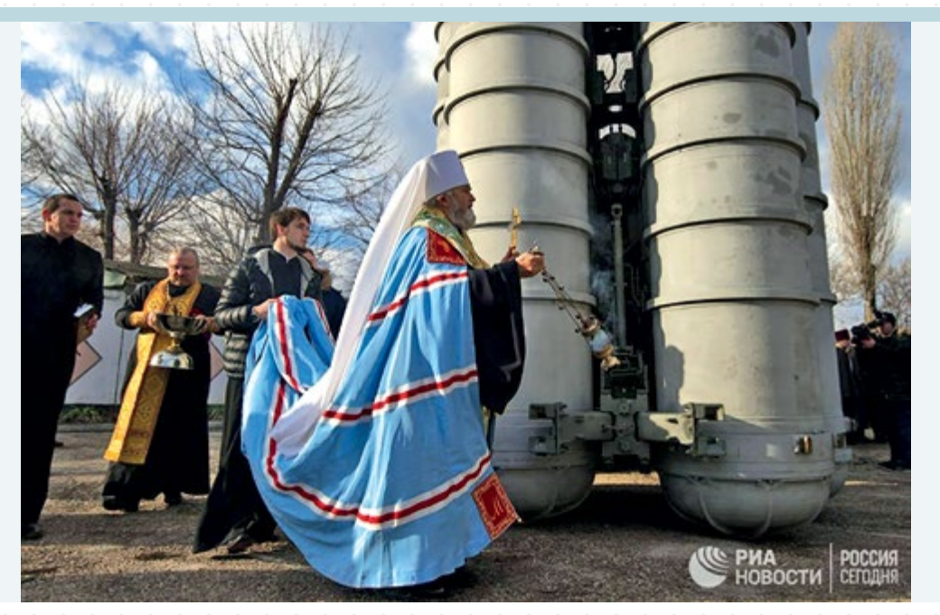
Photo 10. TRIUMPH S400 antiaircraft missile system blessing ceremony in Feodosiya.

July 29<sup>th</sup> 2016 (when the amendments of 'Yarovaya's Package) had come in force) a mass baptism in sea was held in Yevpatoria<sup>123</sup>. On January 14<sup>th</sup> 2017 TRIUMPH S400 antiaircraft missile system blessing ceremony was held in Feodosiya<sup>124</sup>. On July 20<sup>th</sup> 2017 a church procession dedicated to the Christening of Kiev Rus', with about 500 people participating, was held in Simferopol<sup>125</sup>.