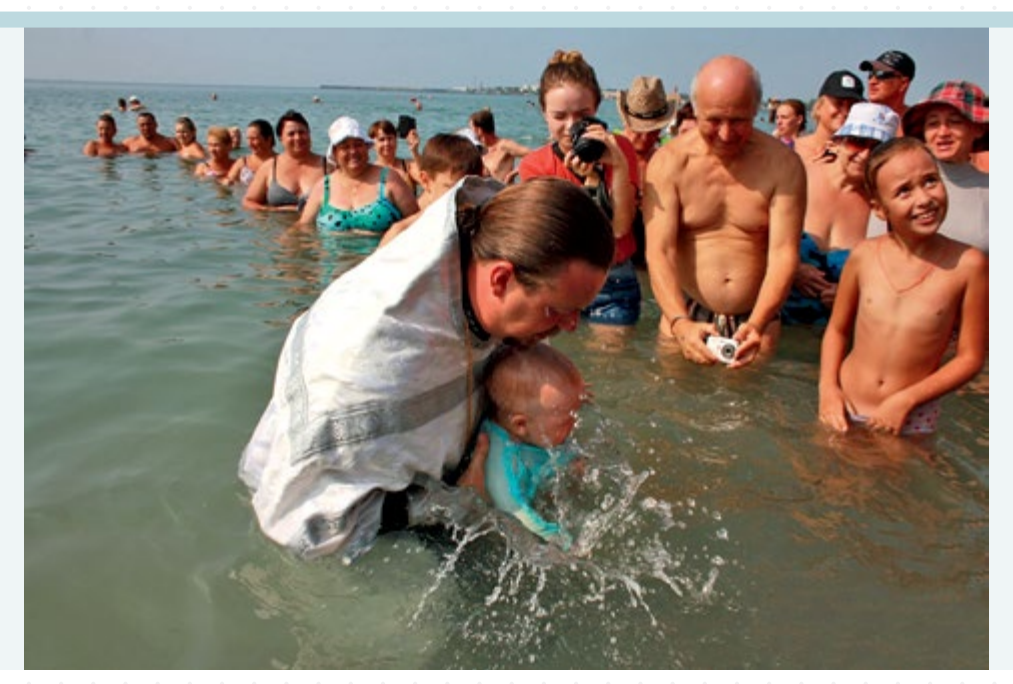
Photo 9. A mass baptism in Yevpatoria, July 29th 2016.

July 29<sup>th</sup> 2016 (when the amendments of 'Yarovaya's Package) had come in force) a mass baptism in sea was held in Yevpatoria<sup>123</sup>. On January 14<sup>th</sup> 2017 TRIUMPH S400 antiaircraft missile system blessing ceremony was held in Feodosiya<sup>124</sup>. On July 20<sup>th</sup> 2017 a church procession dedicated to the Christening of Kiev Rus', with about 500 people participating, was held in Simferopol<sup>125</sup>.