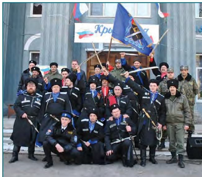
Crimean Kazaks with sabers during the celebration of the Crimea occupation anniversary. Lenino Settlement, 16 March 2015.

On January 25 2016 Sergey Meniaylo, ‘Governor’ of Sevastopol, approved the Charter of the Sevastopol Kazak Area, a local Kazak association. 41 The charter enlists