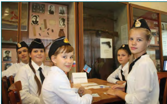
Participants of the I AM PATRIOT of CRIMEA Game held in the Feodosiya Museum of Antics, Feodosiya, 9 December 2016.

Sevastopol. The action for the schoolchildren was supported by Kazak societies: 'Nakhimovskaya Terskaya Sotnia' and 'Sviato-Nikolskaya Kamyshovskaya Sotnia', 'Sevastopol Kazak Area'. 126