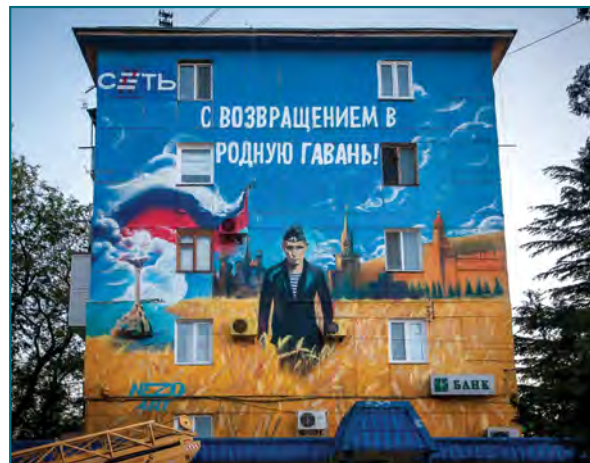
Mural presenting Mr Putin in the navy uniform, Sevastopol, May 2014. The inscription on the mural: 'Welcome Back to Home Harbor!'