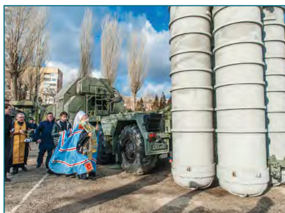
Metropolitan of Feodosiya and Kerch Platon is blessing the RF anti-craft missile systems S300 and S400 in Feodosiya on 14 January 2017.