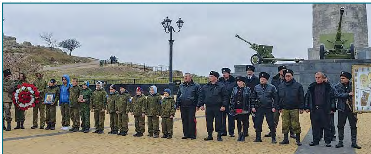
Representatives of Kerch 'Union of Monarchists' and children at the prayer rally in Kerch, 15 November 2016.