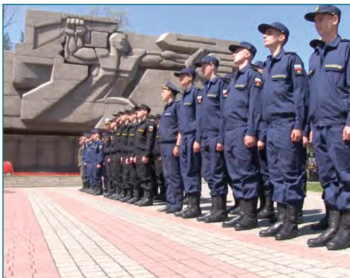
Sending Crimean draftees to the RF territory to serve beyond the Crimea borders. Sevastopol, 25 May 2017.

The Crimeans called into the RF AF in 2015 – 2016 have been serving in the RF Armed Forces on the territory of Crimea. But since spring of 2017 they have started doing the military