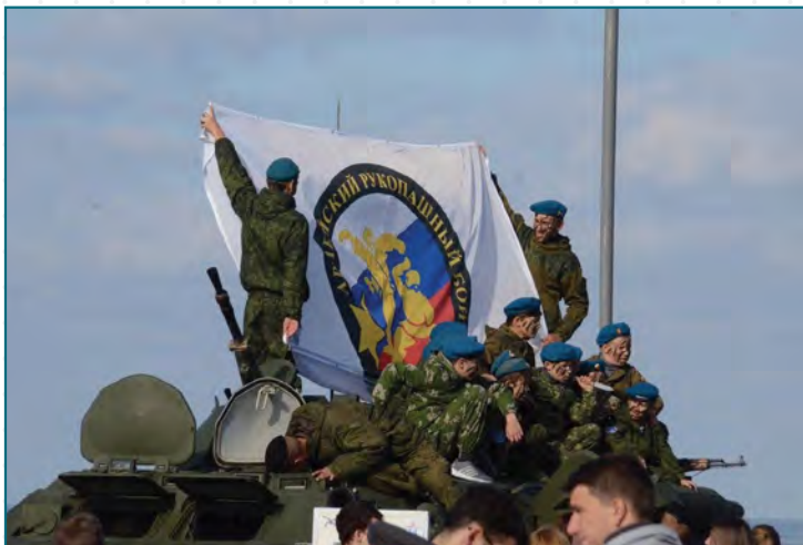
Schoolchildren during the Yunarmia membership initiation ceremony. Sevastopol, 29 October 2016.