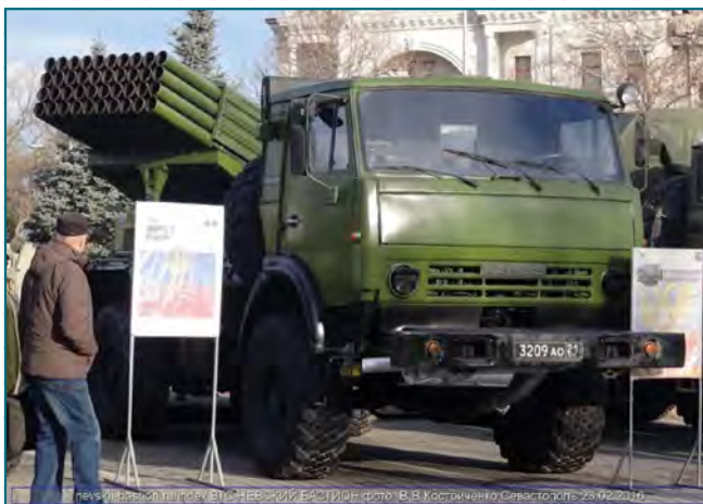
GRAD multi launch rocket system at Military Equipment Exhibition in Sevastopol 23 February 2016.

The military equipment is delivered from the RF to the peninsula by Kerch Ferry Line 8 , by sea (RF Navy watercraft) as well as by air (military transport aviation).