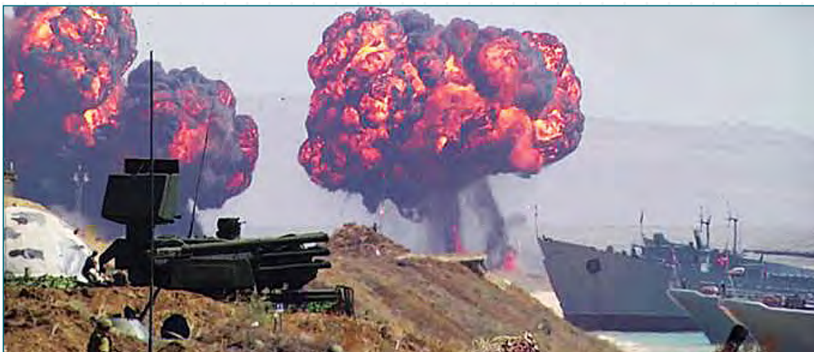
Final phase of the RF Ministry of Defense war game in Crimea, Opuk training field, September 2016.

Parades of the military men, paramilitary unit members and military equipment are regularly held in Crimea. They are dedicated not only to the Victory of USSR in WWII, but also to anniversaries of various war conflicts, including the Crimea occupation. Parades dedicated to the anniversaries of establishing the RF military units and subunits take place in Crimea on a regular basis.