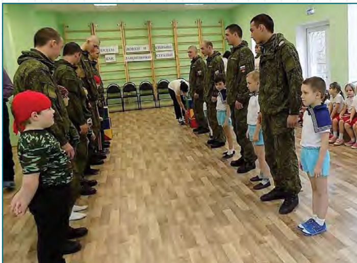
RF military men at the matinee in the Nursery School No 28 in Kerch, February 2017.

in ORLIONOK Nursery School No 28 on February 23, 2017. Soldiers of Military Unit No 98546 of RF Armed Forces were invited to the celebrations to the nursery school. 31