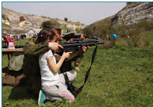
Child is being taught to fire weapons at the event organized by the Crimean 'Association of Knights', Crimea, April 2016.

In addition, the children from Crimea are transported in organized way to the territory of RF to participate in the military patriotic events. 98 For instance, the SOYUZ 2014 — SUCCESSORS of VICTORY All-Russian Youth Training Camp of Military Sports Organizations and Cadet Units was held on April 30–May 10 2014 in the city of Naberezhnye Chelny (Republic of Tatarstan) under the patronage of Mr Rustam Minnikhanov, President of Republic. The children from Crimea participated in the event.