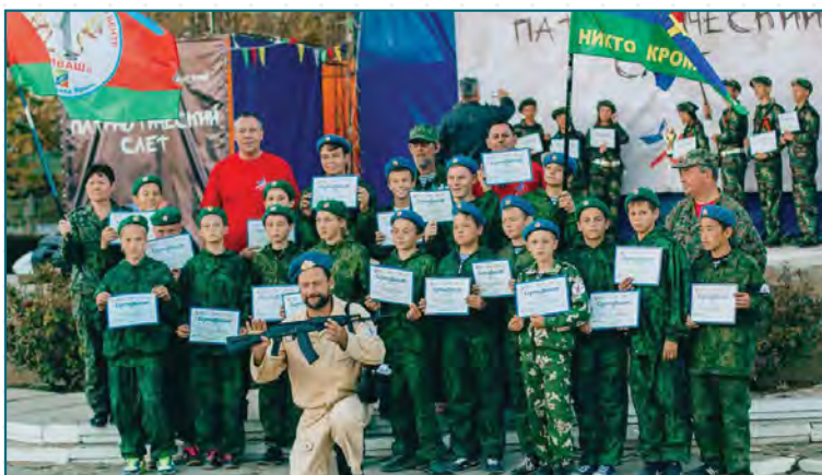
Trainees of SIVASH Military Patriotic Center who won the top award of the military patriotic rally – a model of assault rifle.