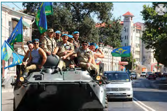
RF military men and representatives of 'volunteer corps' are driving the APC through Simferopol on celebrating the RF Paratroopers Day. 2 August 2015.

The priests bless the heavy weapons brought to Crimea, fixing the idea of a necessary militarization of Crimea in the conscience of the faithful.