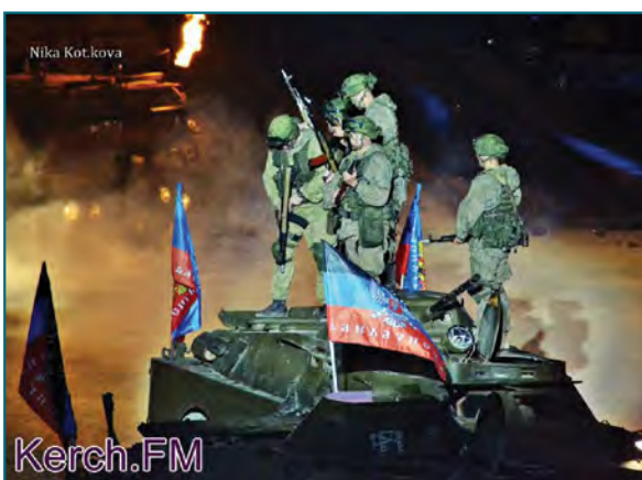
APC, people in military uniform and flags of DNR fighters in Arc of Salvage drama. Sevastopol, August 2016.

A monument dedicated to the RF military men that participated in the Crimea occupation was opened in Bakhchisarai on 17 March 2016. 174 On December 30 2016 the 'authorities' of Crimea'