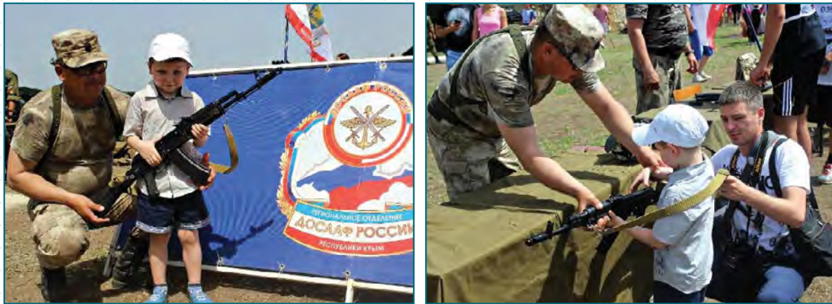
A pre-school age child is holding the assault rifle at the Race of Heroes event, Crimea, Angarsky Mountain Pass, 18 June 2016.

Victory', 'Lilac of Victory', 'Forest of Victory', requiem parties, rallies, local Olympics, celebratory assemblies, etc. 121 Mr Sergey Aksenov, head of 'Government' of Crimea, is chairman of the RVIO Crimean branch. For instance, the RVIO Crimean branch members participated in the All-School Open Lesson 'Russia and Crimea — Joint Destiny' for pupils of 9-11 forms where Mr Aksenov told about the 'Crimean Spring' events. 122