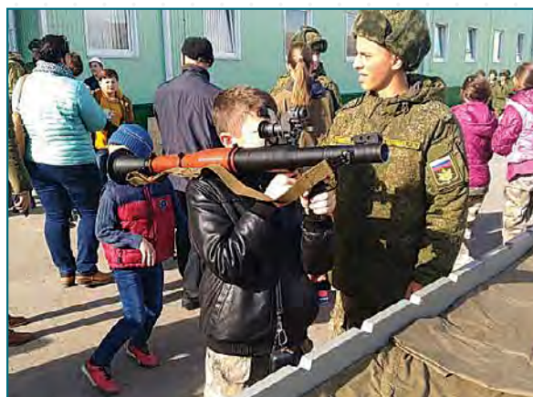
Crimean schoolchildren during the excursion to the military unit organized by the MP Orthodox Church, Simferopol, 22 October 2016.

pupils of 3a Form of Lyceum School of Stary Krym UVK No 3 were invited. Some actions in the framework of this prayer service took place at the military training field. 148