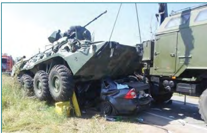
TRA with RF Armed Forces APC in Crimea that caused the death of two peaceful residents, 23 July 2016.

Captain Viacheslav Trukhachiov, head of Black Sea Navy information support unit, stated in the mass media that the military convoy was directing to the training area. According to his information, the civil car driver lost control and crossed into the oncoming lane where collided with APC80.