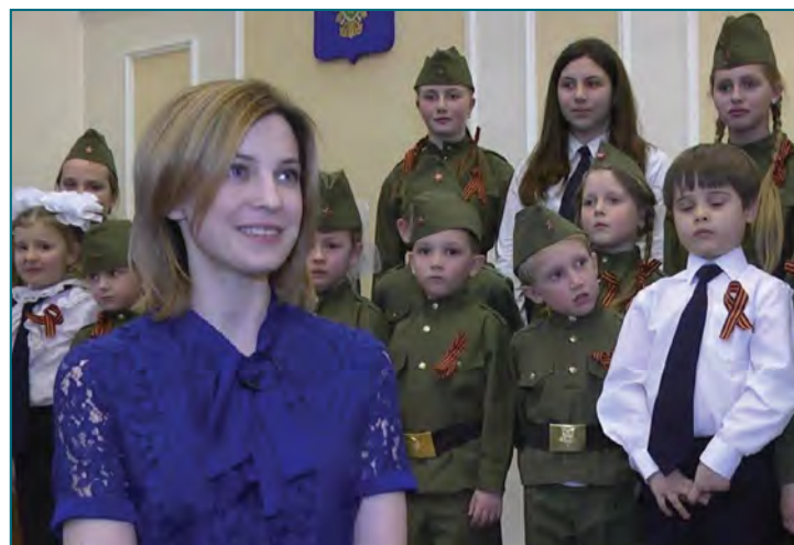
‘Little Prosecutors’, Choir of Natalia Poklonskaya.

The website of Sevastopol ‘government’ published ‘Report on using the budget as at 1 January 2017’. It says that RUR12,452,123.00 were spent for funding the events aimed at spiritual, moral and patriotic education of the youth within the reporting period. 103