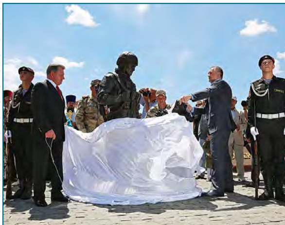
Opening of monument to RF military men who participated in the occupation of Crimea. Simferopol, 11 June 2016.

Moreover, there is a well developed network for selling souvenirs and toys with occupant military men images on the peninsula. For instance, a toy from the 'Polite People' line that reminds visually a minimized copy of the RF GRU special force soldier, was sold in the SOUTHERN GALLERY Shopping Mall of Simferopol in January 2017. T-shirts with images of military men that occupied Crimea can be