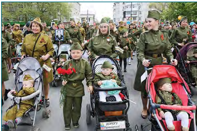
Women with strollers and children in military uniform at holiday parade on May 9 2015, Simferopol.